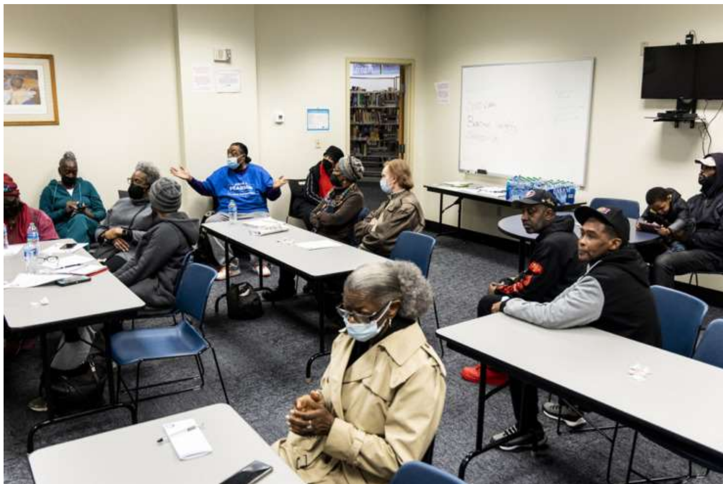
Residents listened and asked questions during a Mallory Heights CDC meeting at the South Branch Library to inform residents about their cancer risk from ethylene oxide emissions from Sterilization Services of Tennessee.

It's the reason the federal government has directed billions of dollars to disadvantaged communities through the Justice40 program. In late April, the White House announced the creation of an Environmental Justice Office to address the disproportionate health impacts from pollution and climate change, in part by addressing research gaps.