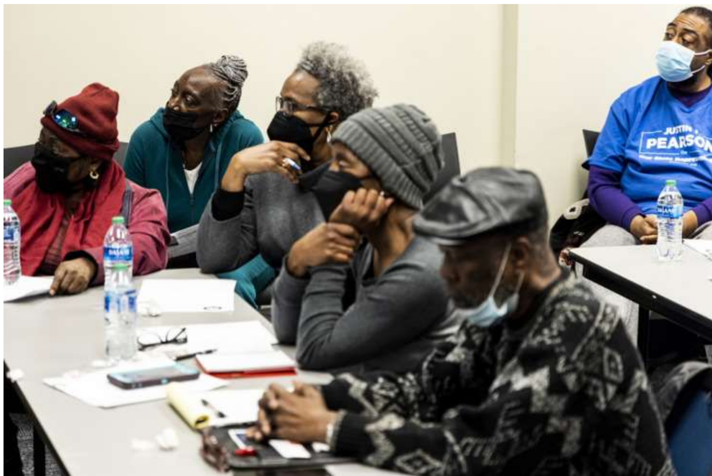
Residents from the impacted area listen during a Mallory Heights CDC meeting at the South Branch Library to inform residents about their cancer risk from ethylene oxide emissions from Sterilization Services of Tennessee.

A decade ago, Jia’s research on air toxics indicated that southwest Memphis is under “significant environmental stress compared with surrounding areas and communities.”